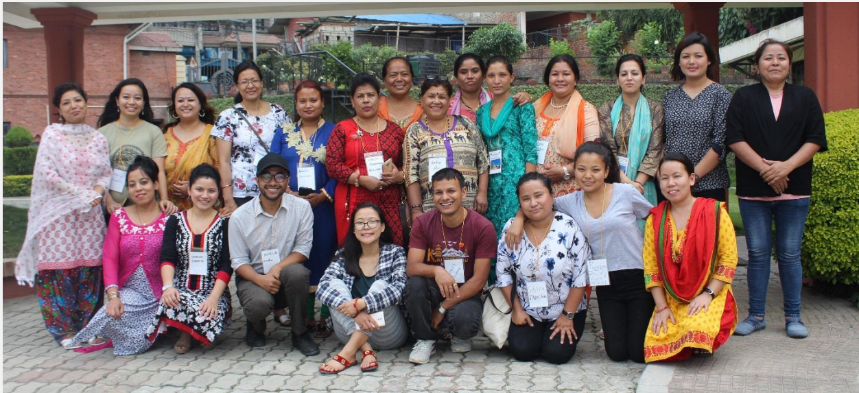
Fig- 46th batch volunteers

These types of trainings to the volunteers intend to capacitate them and also make them ready for Tewa's different works and advocacies.