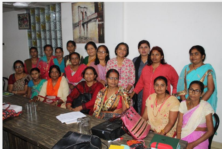
Grantee Partners during Capacity Building Training @Janakpur

system that is still in practice although it is legally punishable, disaster preparedness and sharing of one's experience was conducted during the training.