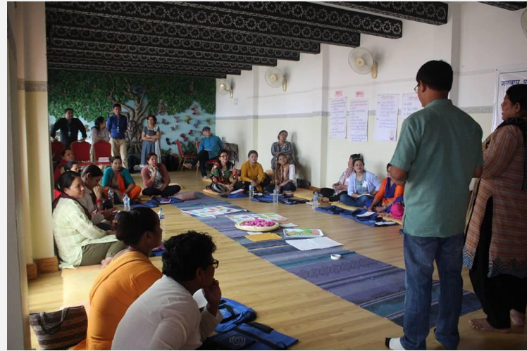
Participants during Capacity Building training on Climate Change

Accountability in Climate change. The total no. of participants in the training were 24; 14 were grantee partners of Tewa while 9 were through the network of Prakriti Resource Center. This training provided insights on climate change and climate finance, as well as who, and where to access to if funds are required to tackle the problems caused by climate change.