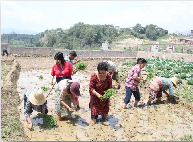
Tewa team planting the Rice Saplings

Between the months of April to June we had nine different organizations host their programme at DeepYogini (Tewa Centre) including Tewa and Prakriti Resource Centre who hosted workshop relating to environmental rights and justices.