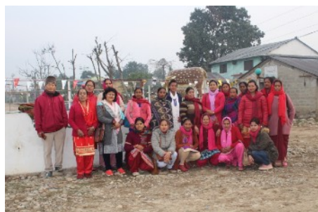
Participants of Sustainable Agriculture in Nawalparashi

We are happy to announce that 21 grants, total of NRs.