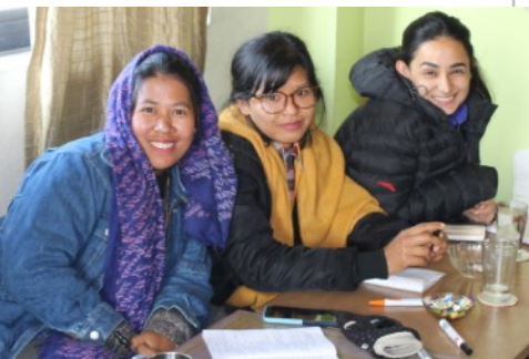
Participants of the 47th volunteer training