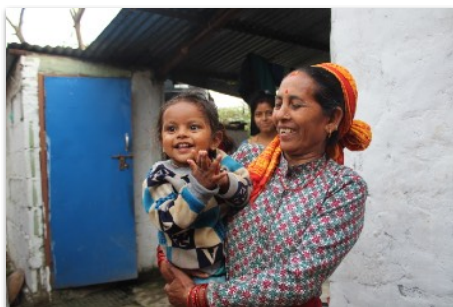
A community woman from Nawalparashi