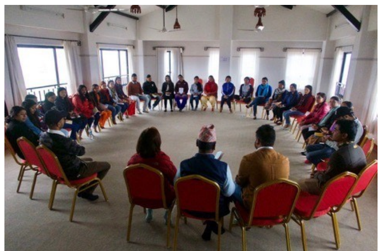
Nagarik Aawaz Youth Programme in Aadhar hall

The major electricity system rectification work was carried out and completed in March.