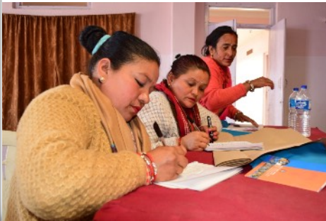
Group work on the indicators of L,M&E at Dhankuta