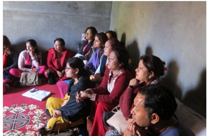
Exposure visit to grantee partner

The purpose of the visit was to help volunteers understand community philanthropy that Tewa practices to empower women with their small support. To motivate and believe that change can happen if we work hand-in-hand.