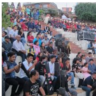
Audience gathered in Open-Air Theater for the concert