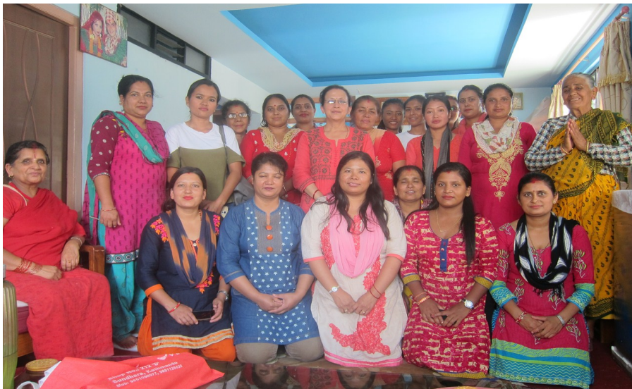
Monitoring Visit at our Grantee Partner Organization