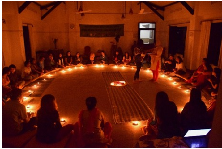
Sangat Participants conducting the session at Aadhar Hall, Tewa Centre.

We signed a Memorandum of Understanding for another year with National Society for Earthquake Technology Nepal (NSET). We also signed an agreement with Save the Children Fund, Kathmandu.