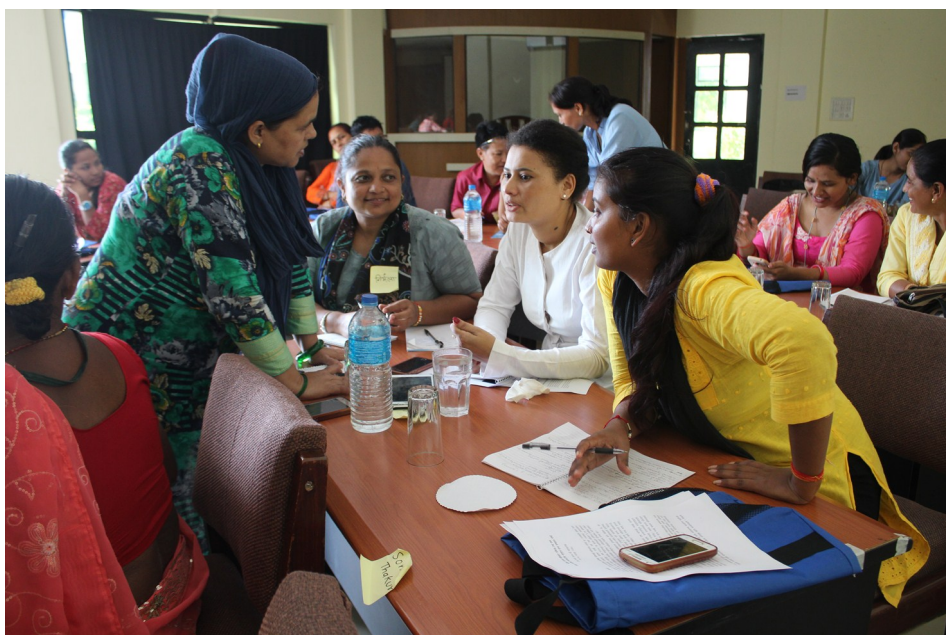
Participants during Capacity building training at Nepalgunj in August

Discretionary grant of NRs 1 lakh was disbursed to Indigenous Women Legal Awareness Groups (INWOLAG) for National level dialogue program on CEDAW Shadow Report on Rights of Indigenous Women