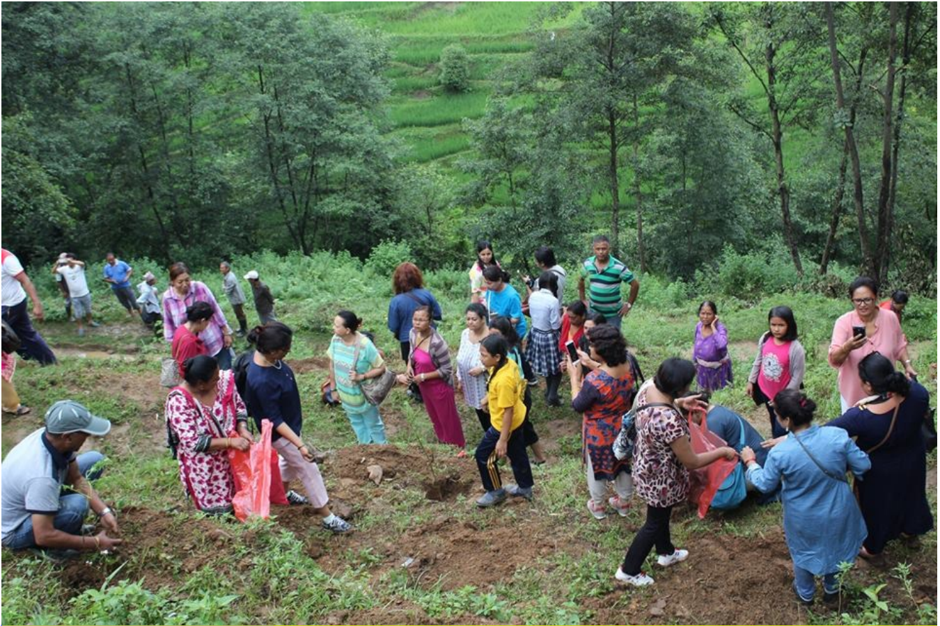
Participants during our Annual fundraising Event: Tree Plantation at Godamchaur