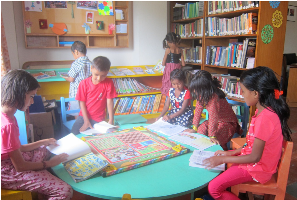
Children during the weekly session at Tewa enjoying the books in the library.