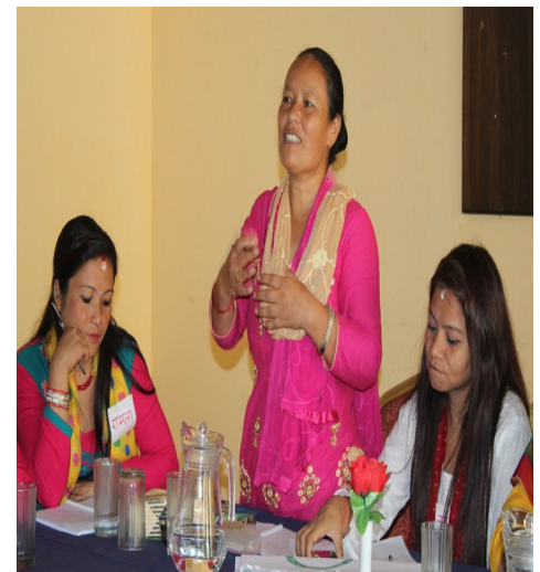
Participant during the training sharing her inputs.

Grantee Capacity Building Training on Advocacy Skill Development was held in Hetauda, Makwanpur in collaboration with Prakriti Resource Center on 26–28th September. 29 participants including 24 from 12 grantee partners organizations from 12 districts and 5 participants from different organizations of Climate and Development Dialogue Forum participated in the training. The participants learned about the ways to advocate and negotiate with the local level government for the budget to implement the project on Environmental Justice.