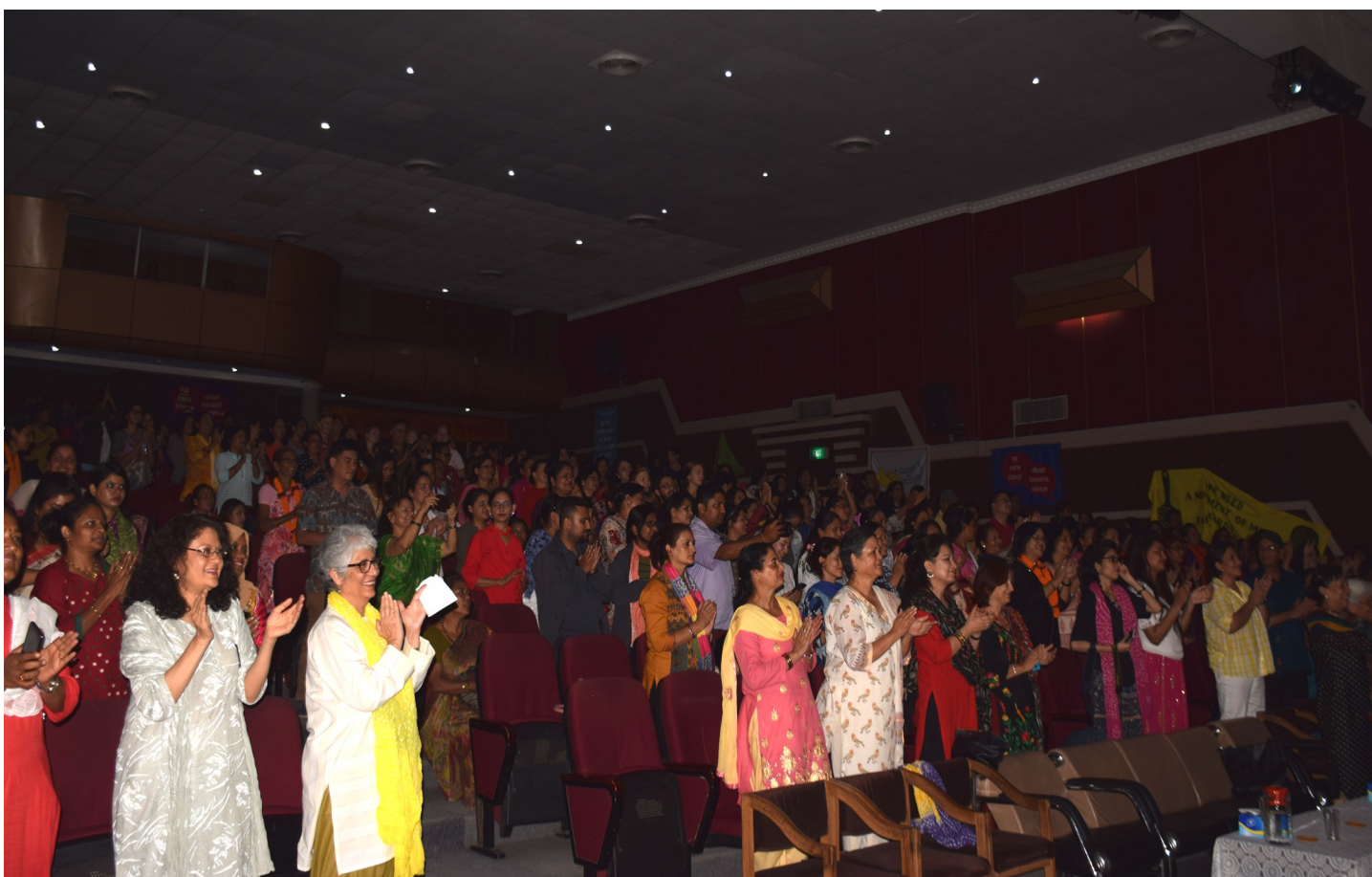
Audience during International feminist Solidarity Event– OBR launch 2019